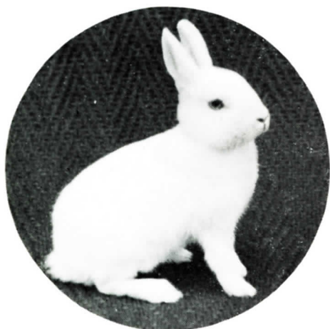
"DANDY" assistant to