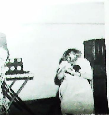
...production from the Lawrence Kings