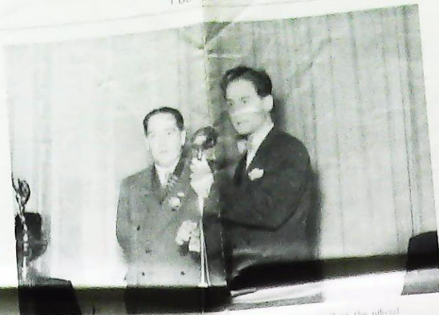
TORNEDO, brilliant Swedish... ...based at the official ...opening