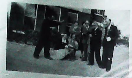
SOME EXONIAN MEMBERS AND FRIENDS