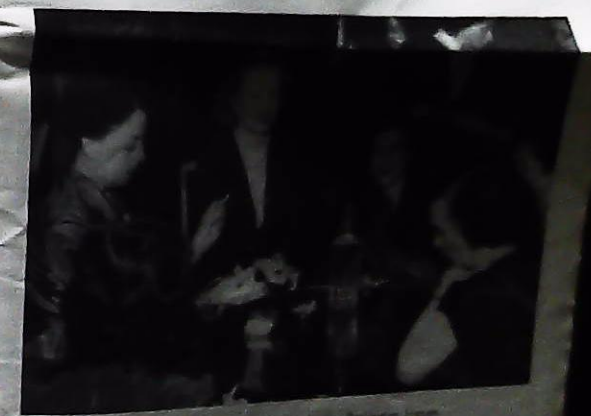
THE LADIES enjoy a luncheon at the Burlington lounge