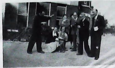
SOME EXONIAN MEMBERS AND GUESTS