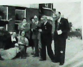
...MEMBERS AND FRIENDS