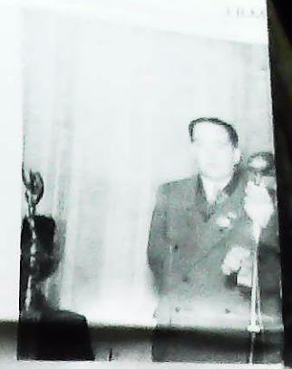
TOINEDO, brilliant Swedish