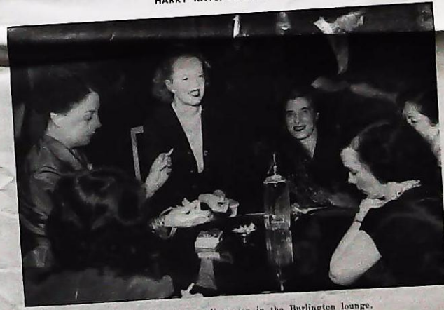
THE LADIES enjoy a discussion in the Burlington lounge.