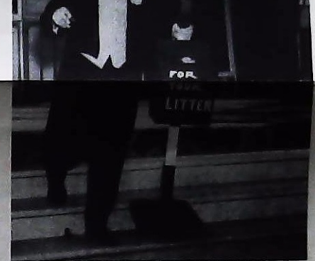
SELBY, from Prudhoe-on-Tyne.