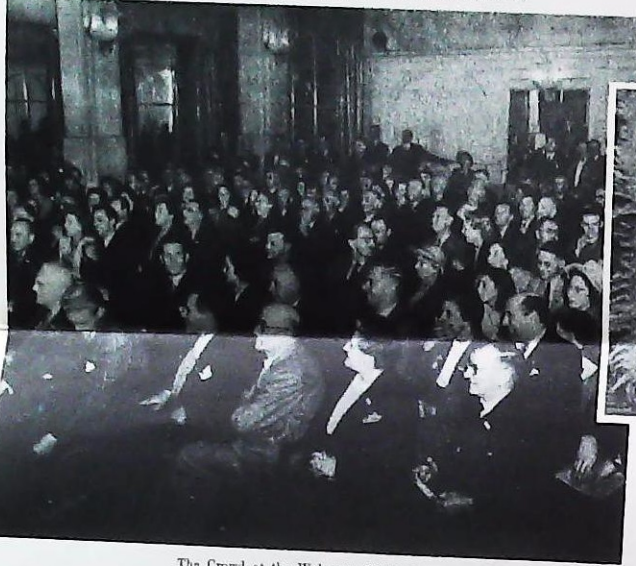
The Crowd at the Welcome of Overseas "Visitors"