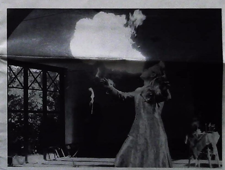
LENZ'S FIRE EATING